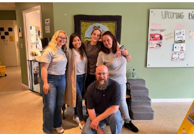
Team members from the Courtyard by Marriott Petoskey at Victories Square volunteered at the Little Traverse Bay Humane Society!