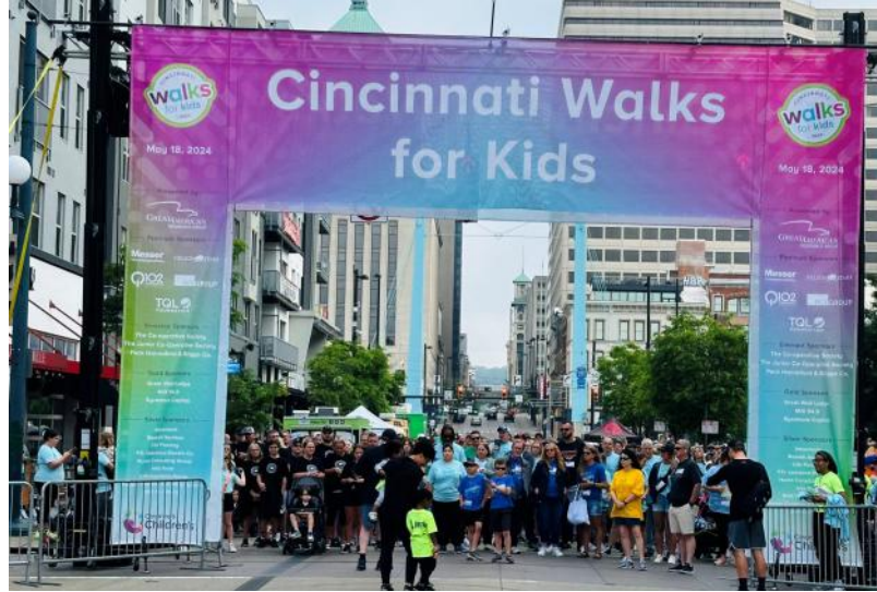
The Fairfield Cincinnati Uptown (CVGMT) team volunteered at the Cincinnati Walks for Children at the Great American Ball Park.