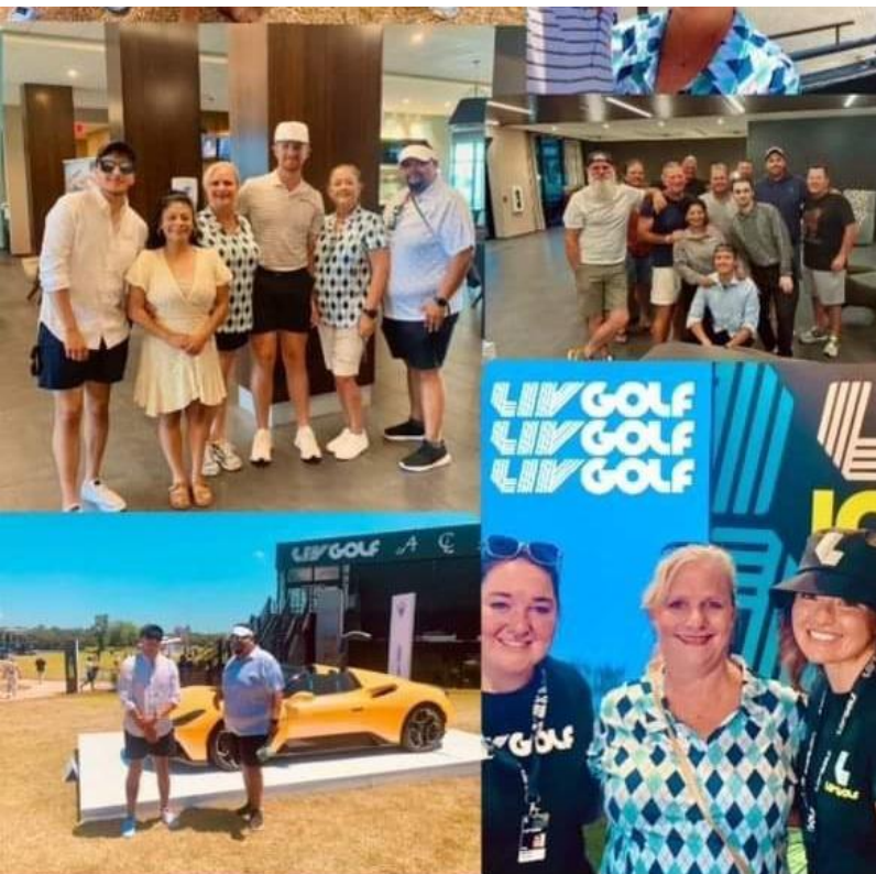
The Courtyard by Marriott Houston staff attended the LIV Golf Tournament June 7-9. The team had hosted the LIV Caddies, Escalante Golf, owners of the golf course at the Houston Golf Club, and Sportfive, the media and entertainment company, for the tour.