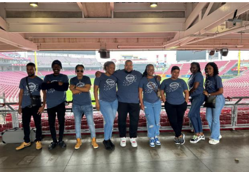
CVGMT— The team worked the walk registration area and distributing t-shirts to all registered walkers. Participation in this event and the money raised helps the researchers at the Children's Hospital.