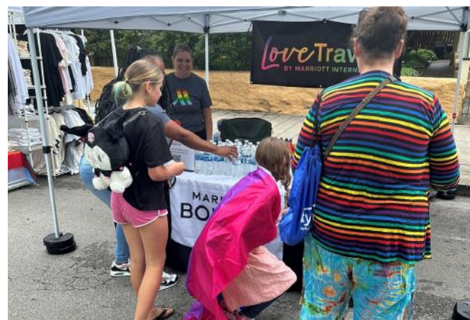
Booth In Action Picture: Sharing information about Marriott Bonvoy with festival attendees.

The staff was working the Marriott booth educating and enrolling attendees in the Marriott Bonvoy rewards program.