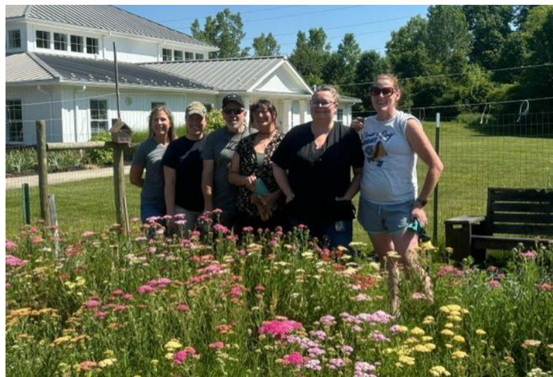
The Courtyard by Marriott New Albany team volunteered at The Garden for All. They harvested and washed spinach, leaf lettuce, scallions, kale, and turnips. At the end of the day The Garden for All was able to donate 159 lbs. of produce.