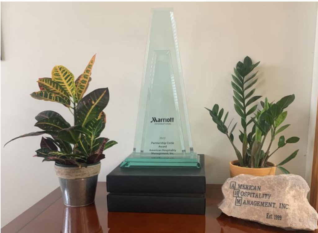
The 2022 Marriott Partnership circle award at the AHM corporate office before it got sent off for the year to visit each AHM Marriott property.