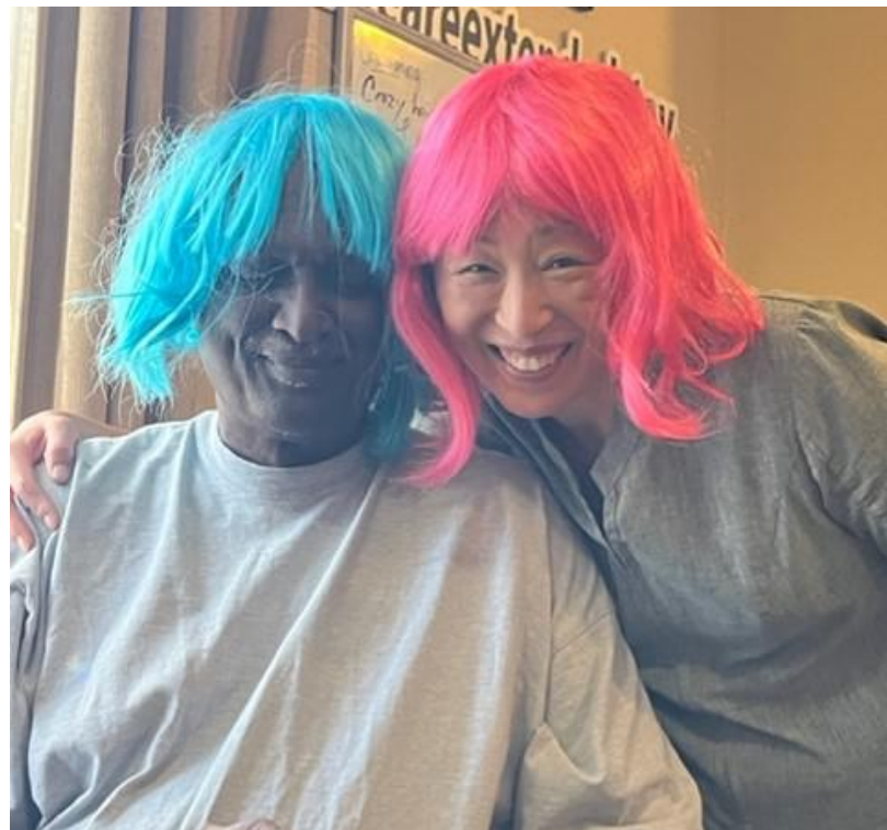
The Staybridge Suites Kalamazoo team had a great time participating in crazy sock and hair day for Celebrate Service Week.